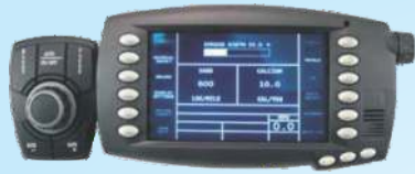
View of Spread Data